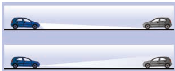
Fig.: System comparison of low-beam lights to daytime running lights

Min. = minimum distance Max. = maximum distance